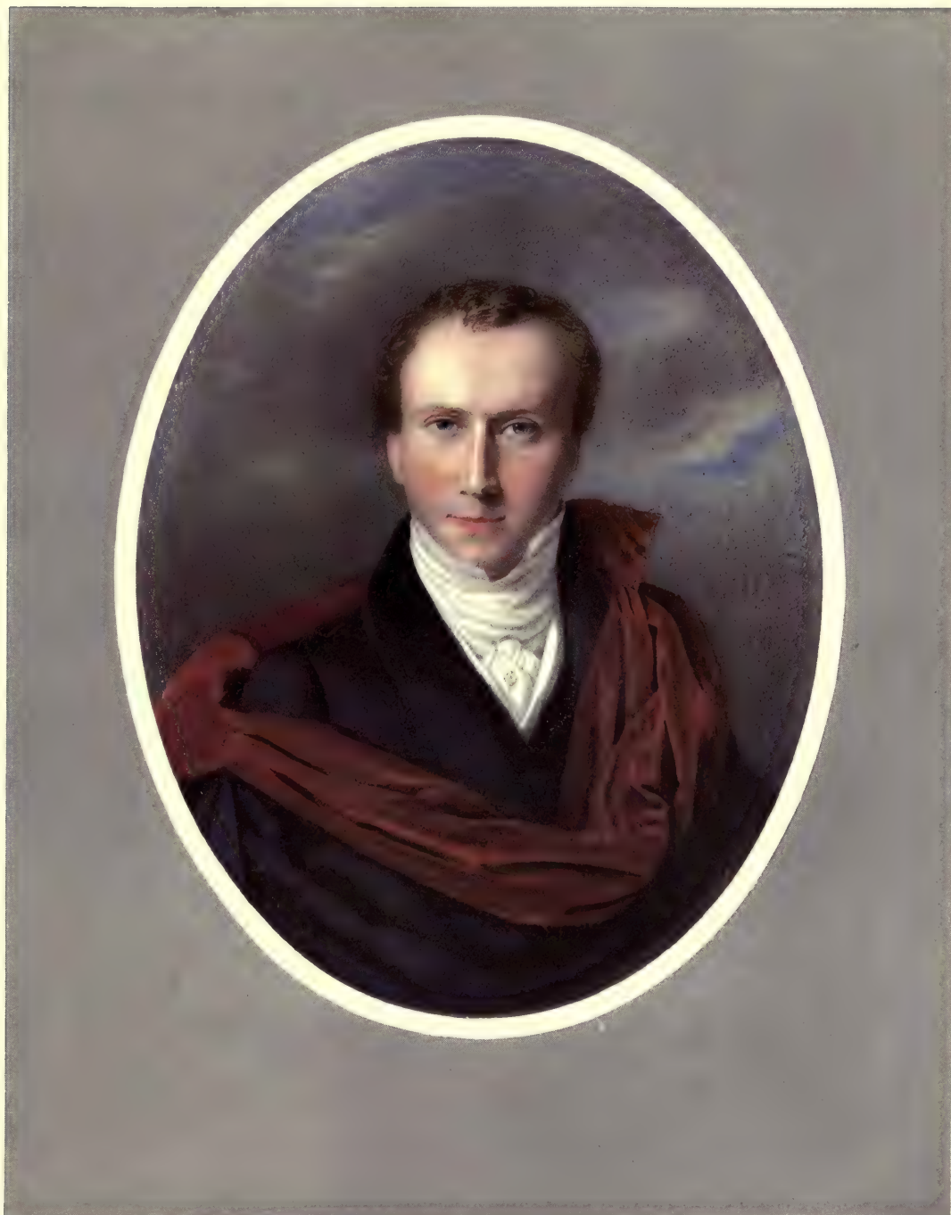
PORTRAIT OF THE ARTIST (1793-1865) BY FERDINAND GEORG WALDMÜLLER